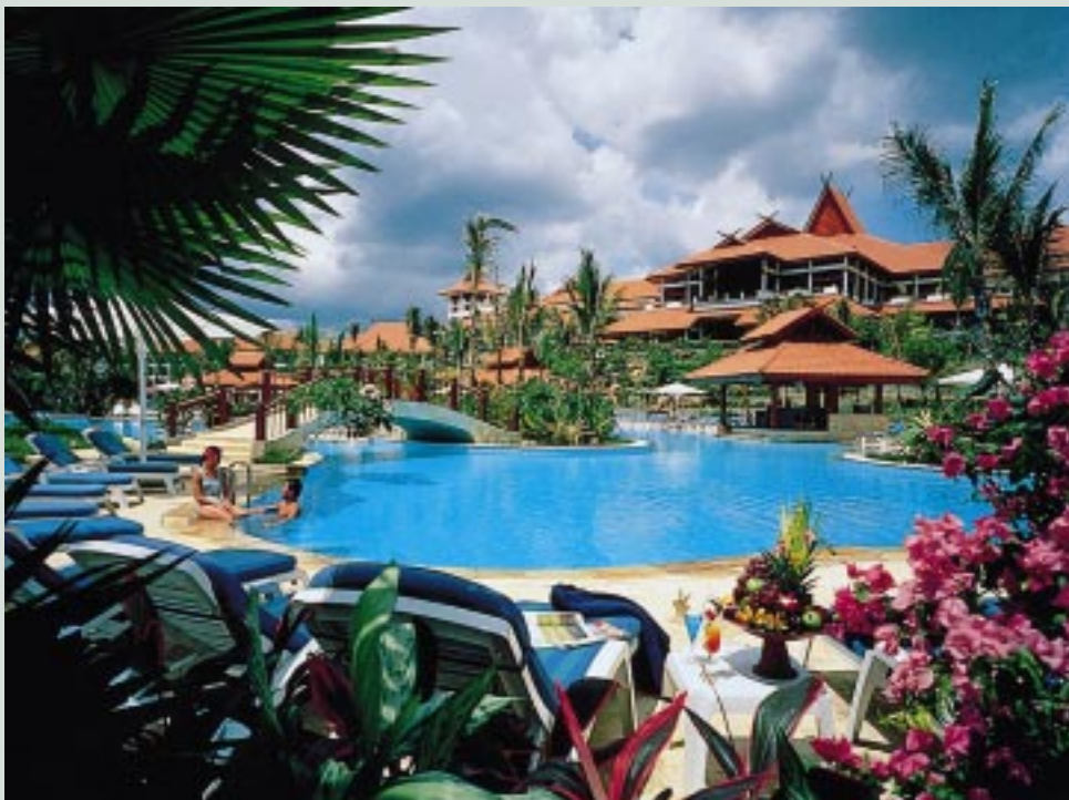
Hotel Sedona Bintan Lagoon is an international class resort which will comprise 416 rooms, 100 bungalows/villas and three golf courses.

During the year, Sedona Hotels International launched two packages, one targeted at business travellers and the other at leisure groups. The former offers business guests all the necessary for a rewarding, hassle-free stay while ensuring a high standard of comfort and friendly service. The latter attractively priced leisure package offers couples and families value-for money getaways at Sedona hotels and resorts.