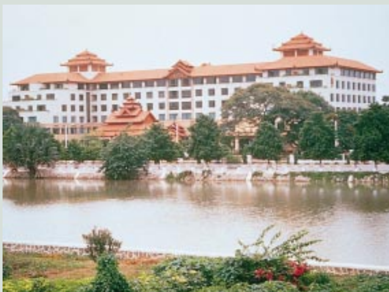
Sedona Hotel Mandalay has commenced operations.

The 230-room Hotel Sedona Makassar in Ujung Pandang, South Sulawesi, soft-opened on 18 January 1997. Situated approximately 30 minutes from the Ujung Pandang international airport, the hotel is centrally located fronting the popular Losari Beach.